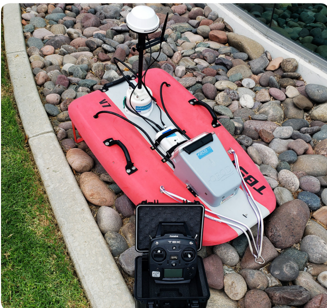
Package includes Torrent board, motorized attachment and handheld control system

Need bathymetric data? Upgrade your RiverSurveyor-M9 system to include the HydroSurveyor/HYPACK hydrographic software package for full surveying capability!