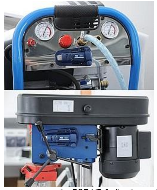
Here you can see the PCE-VD 3 vibration meter being used for the control and analysis of machinery.