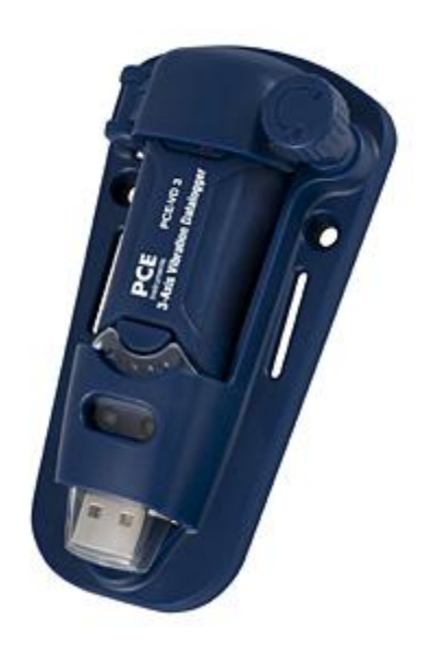
Here you can see the PCE-VD 3 vibration meter with the robust, magnetic and easy wall bracket.